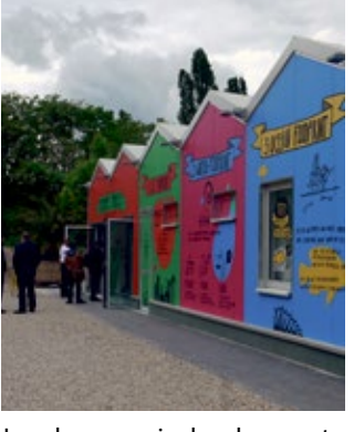
Local economic development